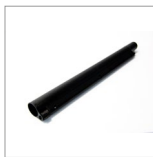
CVON (X3) Hose extensions 44 cm