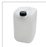
COD0407 Tank 20 lt