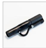
CVK535 nebulizer for handle