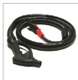
CVP5 Handle 5 mt